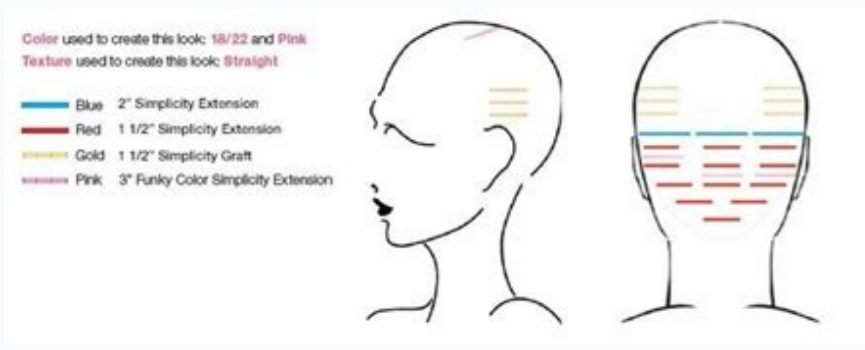
How to apply tape in hair extensions step by step. How to add tape to hair extensions.