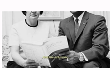
Being 17 parents guide.