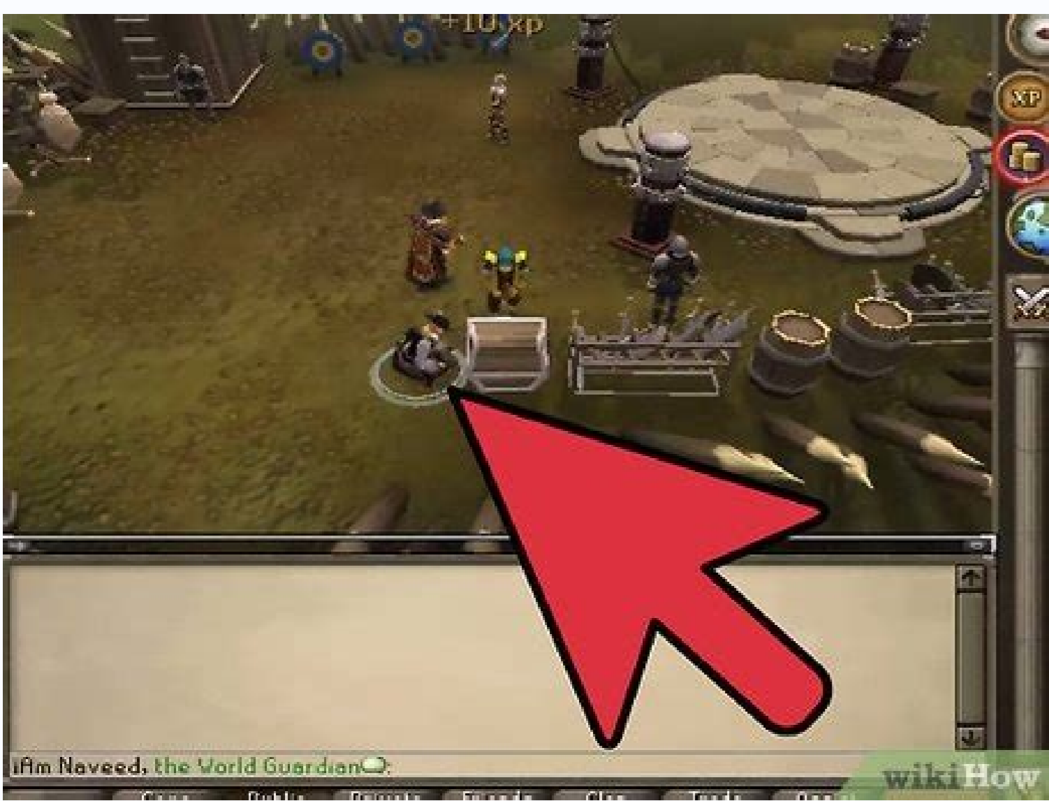
Runescape fletching 1-99.