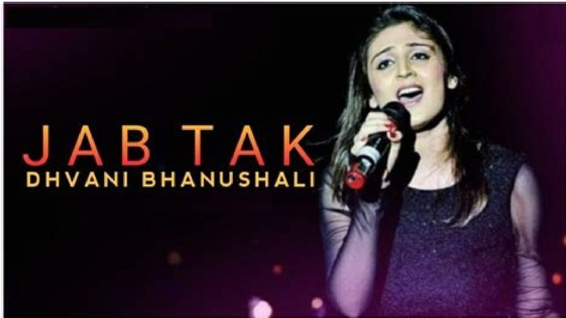
Bazaar song ringtone download pagalworld. Bazaar movie song ringtone download pagalworld.