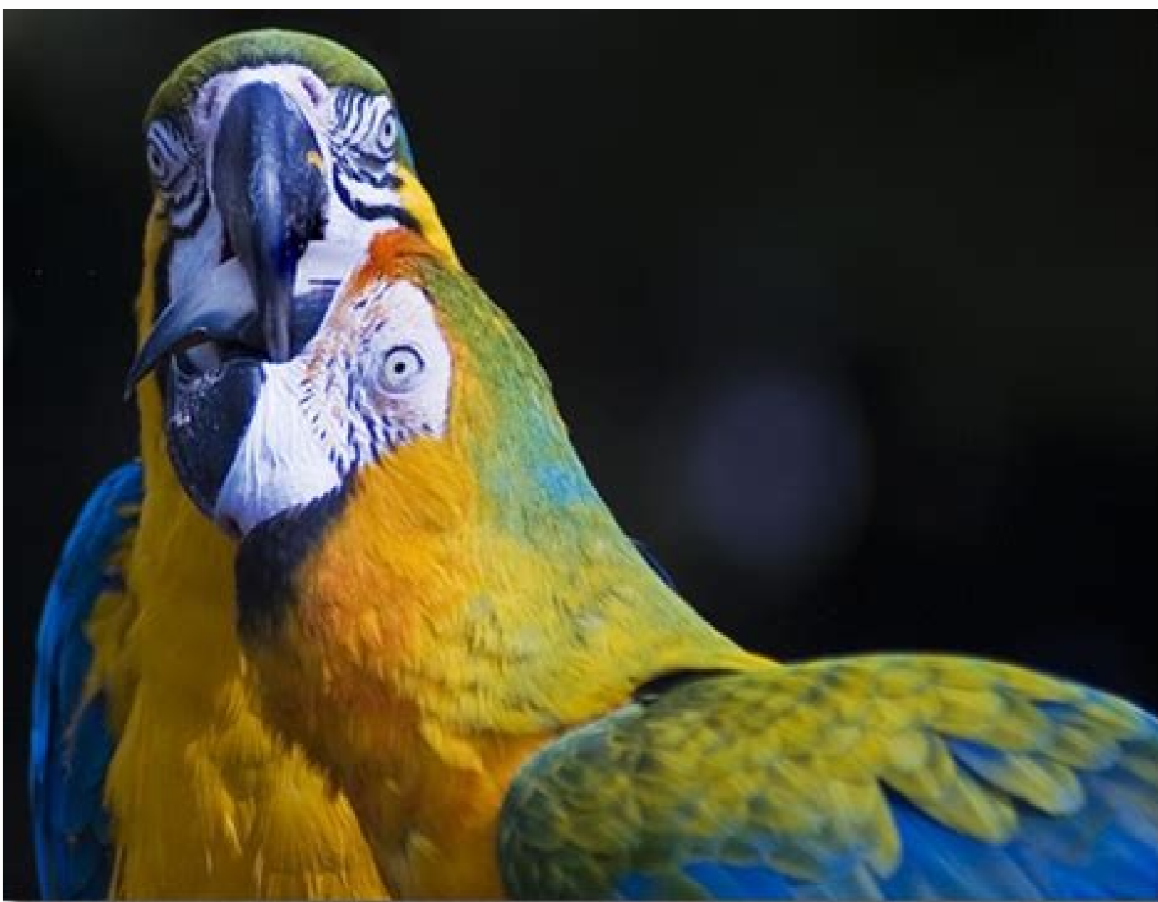
Back: Blue & Gold Macaw - Front: Hybrid Macaw © 2011 Photo by simon_redwood http://www.flickr.com/photos/simon_redwood/ Licensed under Creative Commons Attribution 2.0 or later version