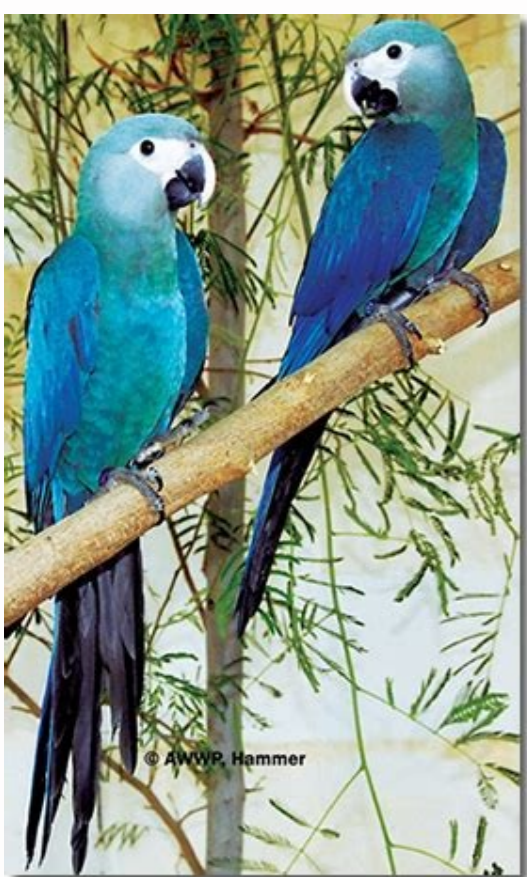
Spix's Macaws (Cyanopsitta spixii)