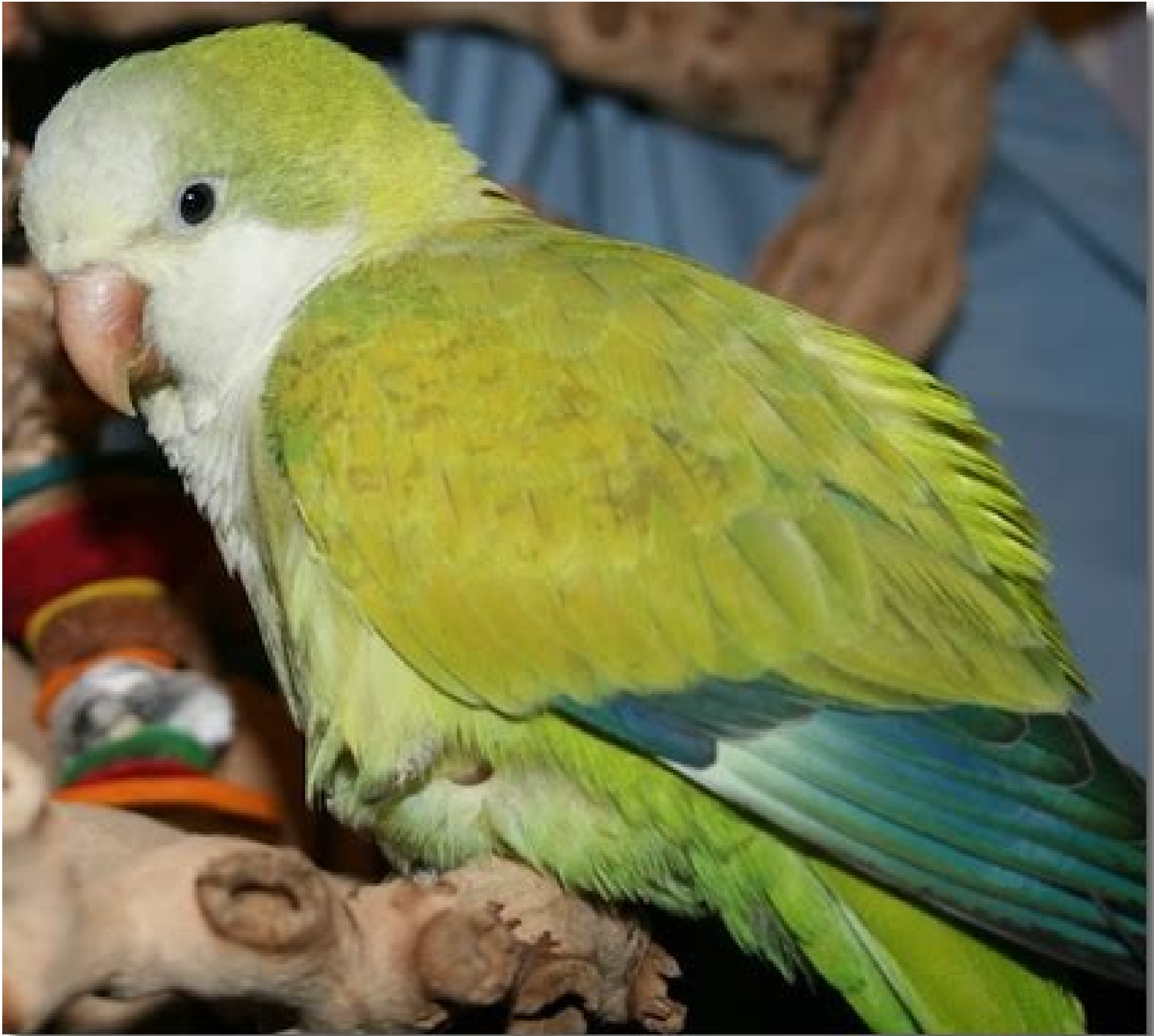
Pallid Green Quaker, Kyoko