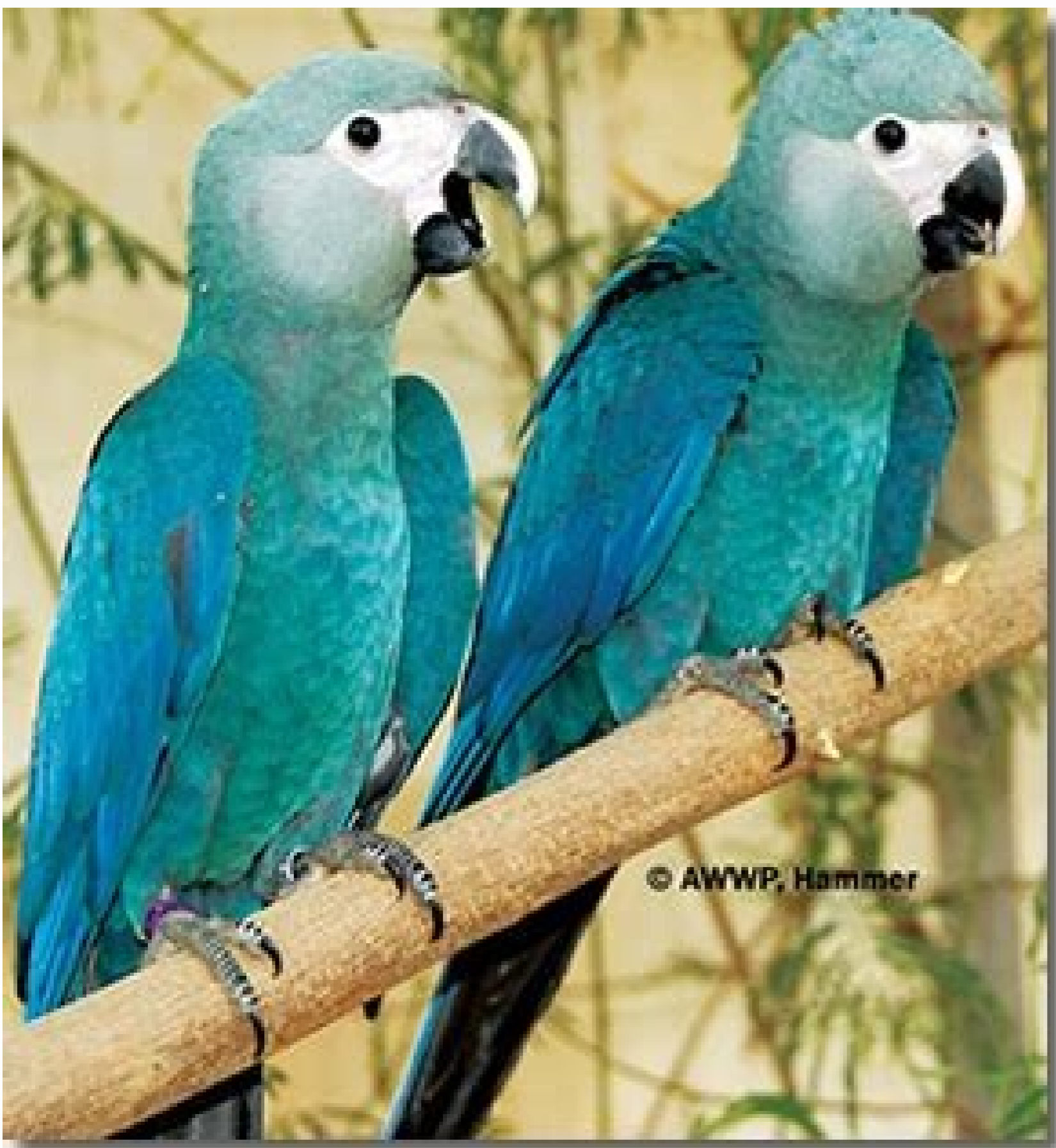
Spix's Macaws (Cyanopsitta spixii)