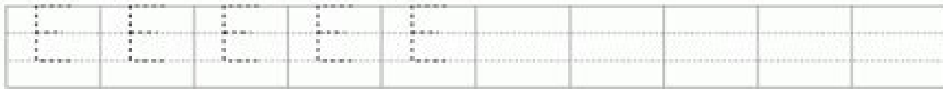
Joint handwriting practice sheets.